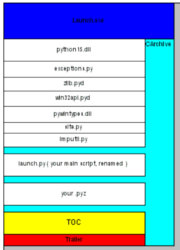
Fig. 3: Structure of the Self Extracting Executable